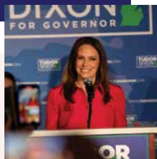
TUDOR DIXON CONSERVATIVE COMMENTATOR

Gov. Whitmer, along with Attorney General Dana Nessel, announced $800 million worth of investments to offer support and resources to those suffering from the opioid epidemic. This comes after Big Pharma was sued and forced to pay a $26 billion settlement to multiple states for their role in perpetuating the opioid crisis. 3